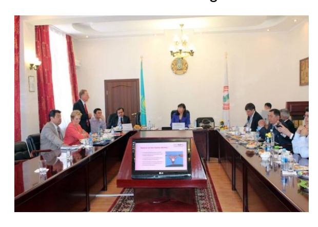
Working group Integration

Please see report of WG "Integration" and FDI website concerning this event.