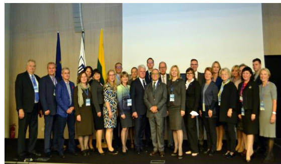
Participants of the Round Table Discussion in Vilnius

during the World Dental Congress in Madrid a separate symposium on oral health for aging population was held.