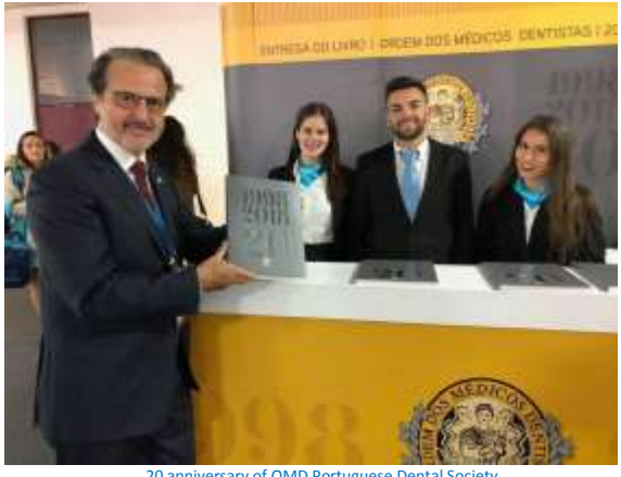
20 anniversary of OMD Portuguese De

In Porto between 8 and 10 November the Portuguese Dental Association held its 27th Congress. It included a debate professional regarding the role of organizations in regulating the exercise of the profession and safeguarding the public interest.