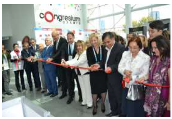
Expo 2018 Opening in Ankara

The 24th International Dental Congress of the Turkish Dental Association in Ankara (27 - 30 September) included a special ERO interdisciplinary session diabetologists entitled: "General and oral health relationship. Implantation and it's challenges in diabetic patients".