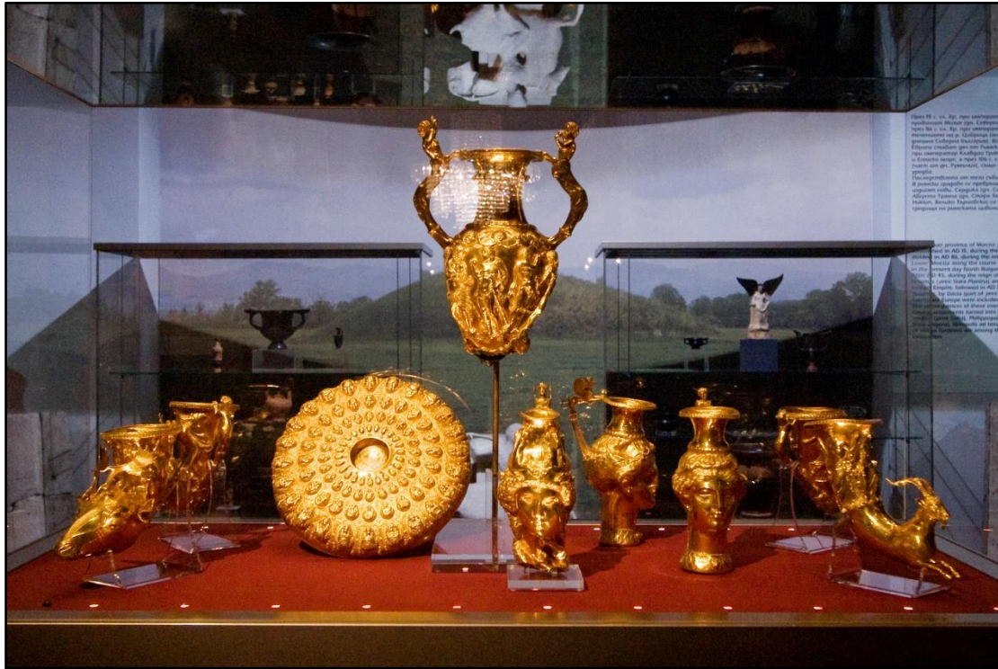
Panagyurishte Gold Treasure

Our museums are full of artifacts dating back to the time of the Thracians – the Panagyurishte Gold Treasure, the Rogozen Treasure and many others are vivid proof of this.