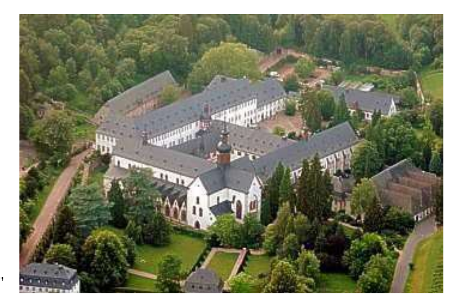
04.45 pm We will continue our tour to the beautiful Kloster Eberbach where the movie "The Name of the Rose" was filmed.