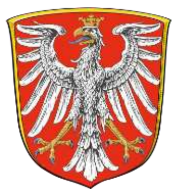
10.45 pm This exciting day ends with the ride back to Frankfurt.