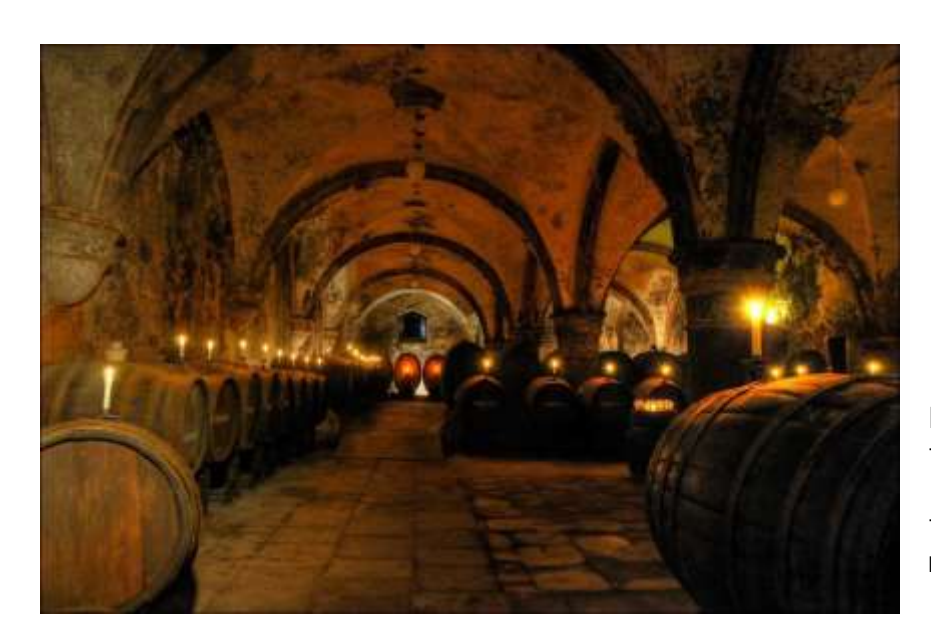
06.00 pm During a comfy stroll through the wine cellar you will have a wine tasting followed by a rustic dinner.