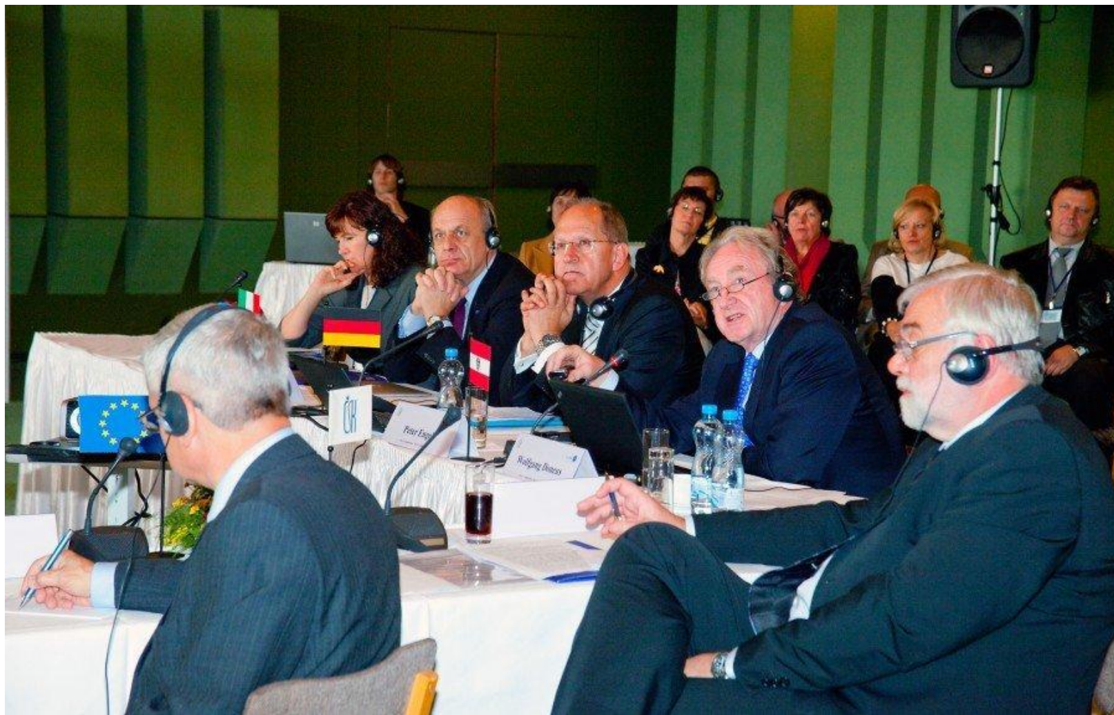
ERO-FDI, Prague, 27 - 28 April 2012