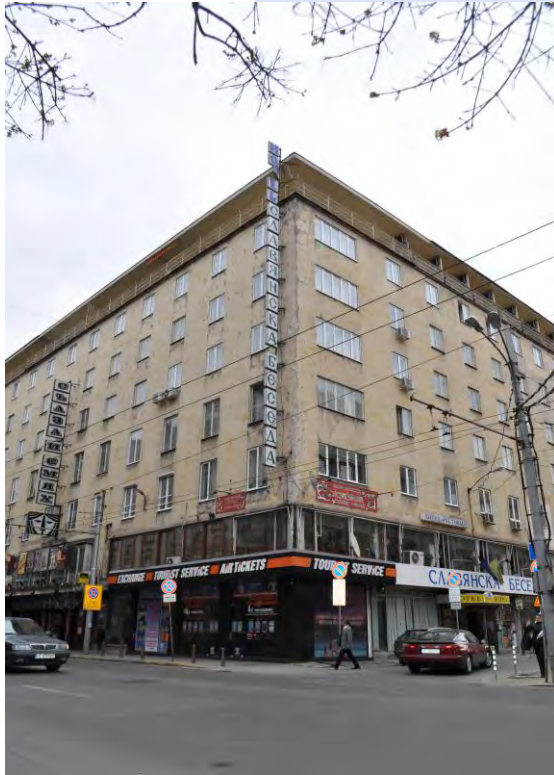
“Slavainska Beseda” in 2010