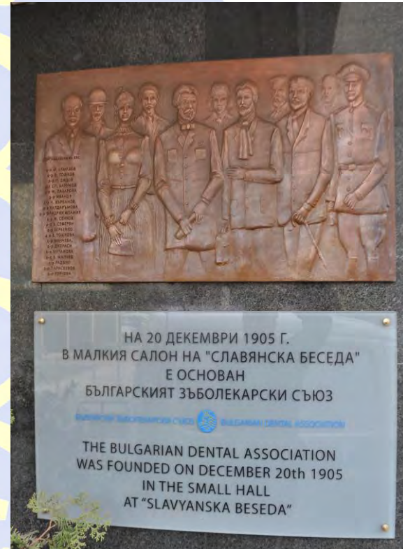
The memorial plaque in honor of the founders of the BgDA at the entrance of the building.